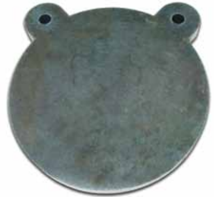
Gong Style Target