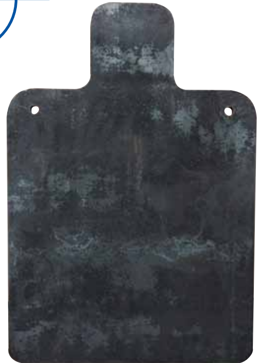
IPSC Style Target